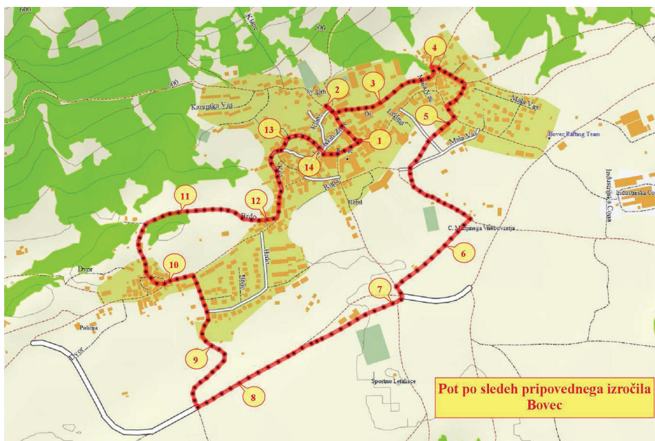
Figure 4. Map of the thematic trail following the narrative tradition of Bovec from the brochure Podeželski elektronski vodič (Rural Electronic Guide) (2013) .