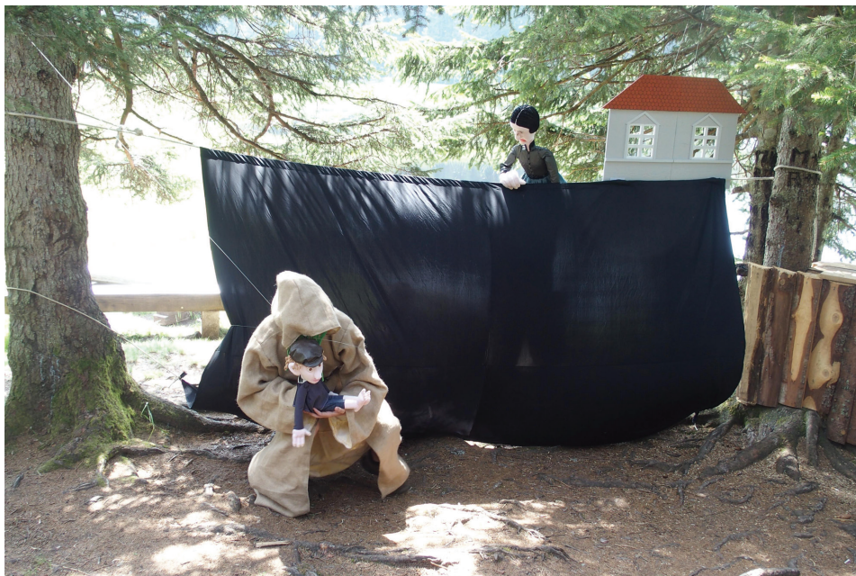
Figure 3. Folktale trail in Pohorje: Črno jezero (black lake) with a puppet show performed by the Koruzno zrno Society. Photograph by Stanka Drnovšek, 11 June 2019.

The folktale trails in Pohorje mostly include legends about people experiencing their natural environment and encountering the supernatural world. The legends tend to be somewhat frightening because apparitions often incite fear. The Pohorje trail starts in Slovenska Bistrica with its most prominent attraction, the Slovenska Bistrica Castle. Its previous owners were the counts of Attems, while today it is state-owned. The starting point in Istria is the settlement Gologorica in the municipality of Cerovo with its Roman Catholic Church of the Blessed Virgin Mary.