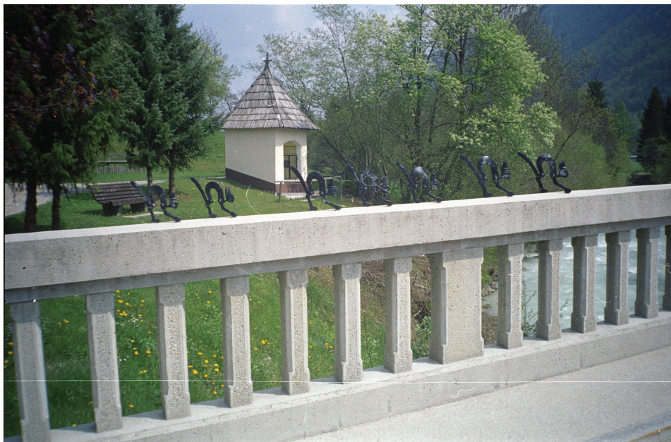
Figure 2. The fairy-tale trail of the Alpine area in Dovje near Mojstrana in Slovenia.

Children are guided through the mythical world of Velika Planina by the Wild Man ( dovji mož ). In Kranjska Gora, children and families can experience folktales about Pehta , Bedanc , and Kosobrin in Kekec Land (Source 7).