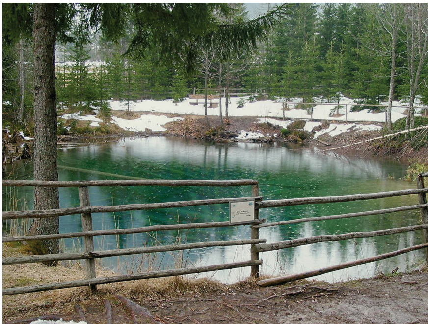
Figure 1a, 1b. Meerauge trail in Bodental above the Loibl Pass in Austria.