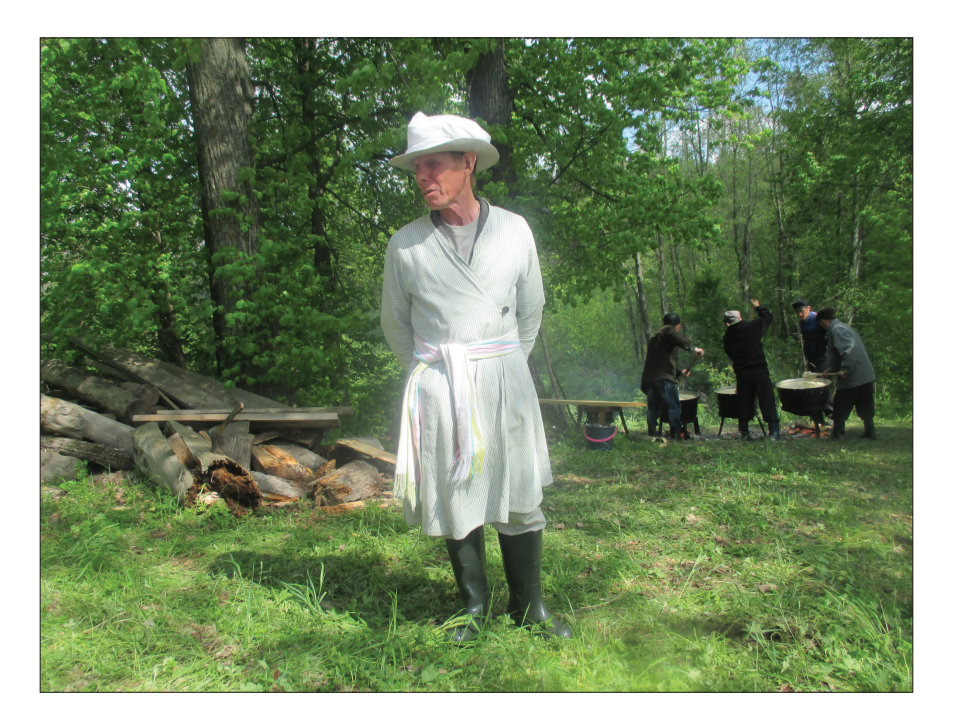
Figure 7. The sacrificial priest of the village of Vyazovka (Tatyshly district, Bashkiria) in his old shortderem. Photograph by Eva Toulouze, June 2017.

This solution was neither solemn nor particularly aesthetic, but it achieved the main goal: to be dressed in white, in order to address the white god. At the beginning of the second decade of the twenty-first century, some sacrificial priests tried to find some other solutions to give their position the desired solemnity. In the Tatyshly district, the priests of the northernmost nine villages have ordered through the cooperative industry some dozens of smocks made of a white fabric with wide vertical stripes, which roughly reminds of a shortderem .