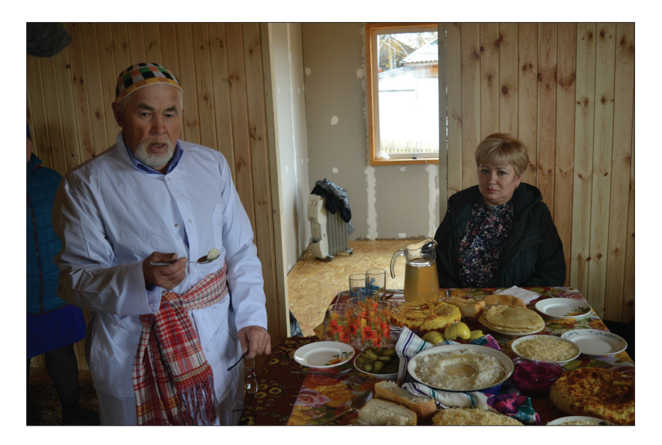
Figure 4. Ceremony for entering a new house in Aribash (Tatyshly district). The sacrificial priest eats the consecrated porridge while praying. Photograph by Nikolai Anisimov, October 2017.

It would be narrow to limit religious practice to the visible dimension of collective ceremonies: every family has its calendar practices (the great day, the