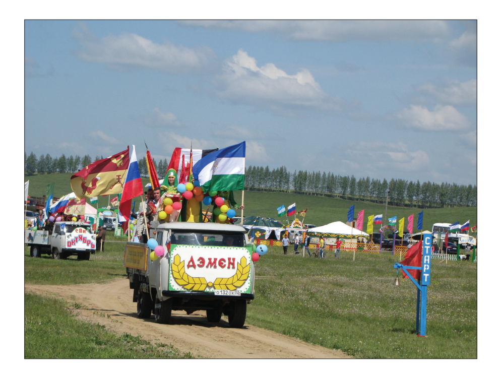
Figure 9. Festive truck of the cooperative Demen at the June 2013 district Sabantuy (festival at the end of the spring field works, Verkhnie Tatyshly, Tatyshly district, Bashkiria).

The salaries in the enterprise were very low. While the older population, without any alternatives, accepted it, the younger ones were no more interested in demanding physical work for salaries which did not allow them independence. Already in 2013, Demen had ceased to be the main employer in the four villages mentioned above. In the following years, the enterprise was bought by several investors in succession, Rustam found another job, and Demen struggles to have