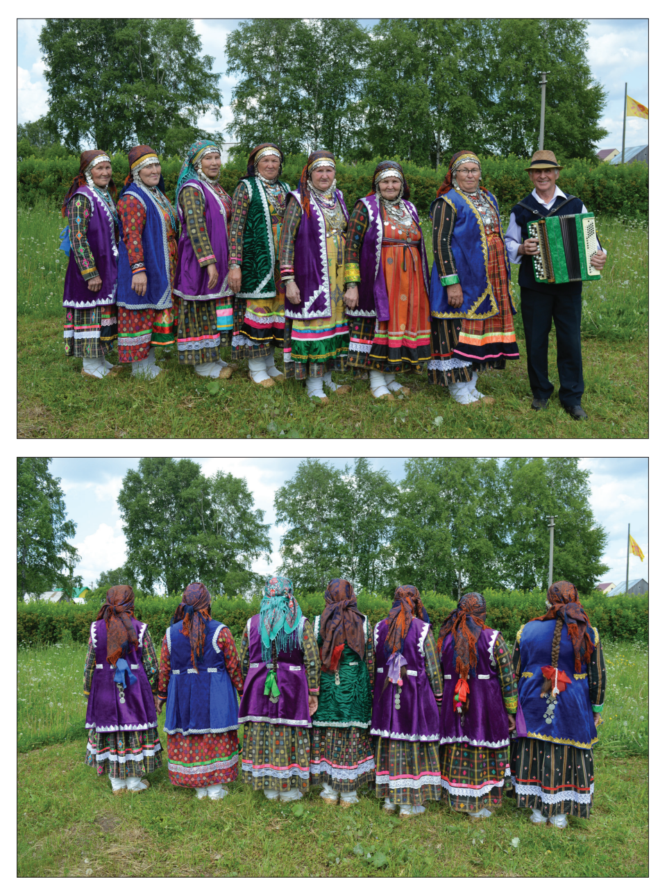
Figures 5 & 6. The Staryi Kyzyl-Yar folk music ensemble Mardzhan (Pearl) (Tatyshly district, Bashkiria) in local folk costumes. Photograph by Nikolai Anisimov, June 2019.

costume was made from homespun material. There is one exception: the ritual dress for ceremonies. We shall just concentrate on this topic and must go back in time for a while.