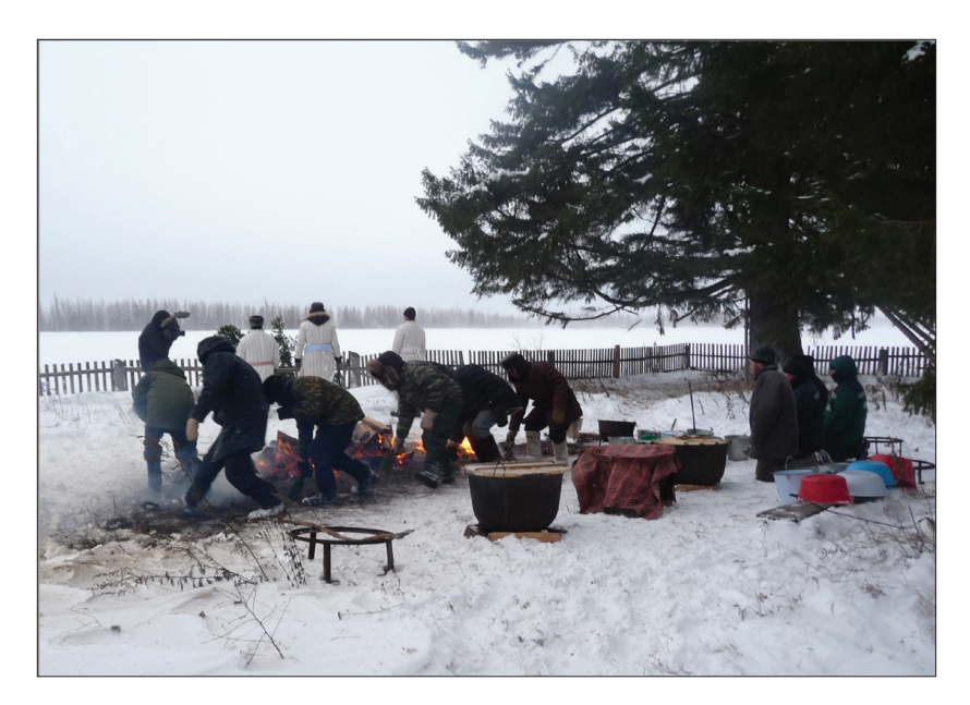
Figure 3. Ceremony Bagysh vös' between Staryi Kyzyl-Yar and Nizhnebaltachevo (Tatyshly district, Bashkiria). Photograph by Eva Toulouze, December 2013.

The first sign, at the very end of the Soviet period, was building prayer houses in the sacred sites used for collective ceremonies that had never been discontinued, on the initiative of the collective farms, and fencing or re-fencing sites. In other cases, where ceremonies had not been held for years or for decades, local leaders looked for potential sacrificial priests mostly among the descendants of former priests and encouraged them to revitalise collective ceremonies. They provided material help – i.e., found ewes for the sacrifice and helped with transportation. In some villages, as Kassiyarovo in the Burayevo district, the population put pressure on the potential sacrificial priest to organise a ceremony: he had been chosen by the previous one before the latter's demise and had never taken over the legacy. After a couple of decades, he was asked to perform and he was willing to do so, also because of unhappy incidents in his family that could have been due to his unwillingness to fulfil his promise (personal communication by Ranus Sadikov in 2015).