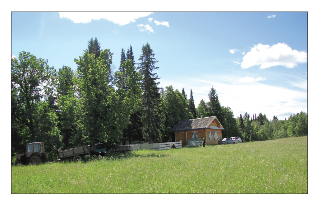
Figure 2. A sacred place in Alga (Tatyshly district, Bashkiria), with a house and a fence. Photograph by Eva Toulouze, June 2013.

In the late 1980s and particularly in the 1990s a process started that is still ongoing: everywhere, revitalisation signs led to the strengthening of Udmurt religious practices, or even the restarting of collective ceremonies. The impulse for this development apparently came from local leaders, but it answered a need in the population, which is clearly manifested in the reactions to new openings (see Toulouze 2016).