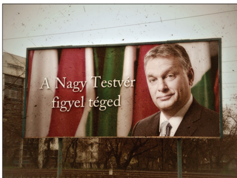
Figure 10.

Another group of examples uses only visual modifications, changing the portrait and/or the background, to achieve incongruity. Several of these examples refer to Viktor Orbán's leadership style by substituting his portrait with those of Hungarian political leaders from the totalitarian regime, e.g. János Kádár (Fig. 11) and Ferenc Szálasi (Fig. 12), as well as the current Russian president Vladimir Putin (Fig. 13).