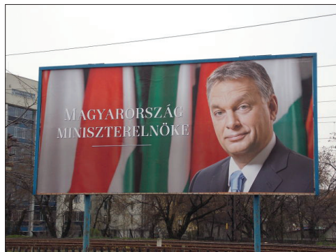
Figure 7.

The last part of this paper focuses on one sequence of variants as a representative example of the online folklore of the 2014 elections in Hungary. The numerous variants were based on a campaign poster for the incumbent prime ministerial candidate, Victor Orbán, of the governing party, Fidesz (Fig. 7).