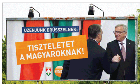
Figure 17.

More recent political events underline that a year later, the poster and slogan, “Respect the Hungarians”, are still known and can serve as a point of reference available for further variation. On May 22, 2015, Jean-Claude Juncker, president of the European Commission and former prime minister of Luxembourg, called Hungary’s prime minister a dictator and playfully slapped him in the face during a press photoshoot at the Riga Summit. 14 A vernacular reaction – in the form of an animGIF – was born within 24 hours (Fig. 17). Together with the inserted video, the original message – asking for more respect from the European Union – gained an entirely new meaning.