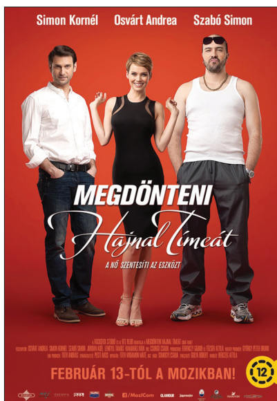
Figure 1.

The original poster for the film released in Hungarian cinemas on February 13, 2014 (Fig. 1), advertises a romantic comedy whose title alludes to sexuality “To Knock Down Tímea Hajnal”. The creator of the parody poster (Fig. 2), a supporter of the liberal coalition Együtt-PM, modified a number of the original poster’s textual and visual details. In the parody poster, the