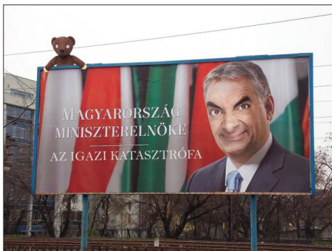
Figure 14. Source: http://cink.hu/magyarorszag-miniszterelnoke-2-1545105733 , last accessed on 25 September 2018.