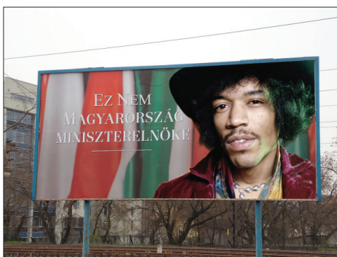
Figure 15.

Following their success in the parliamentary election, Fidesz repurposed the posters (shown in Fig. 7) for the European Parliament campaign by pasting a new text over the old one: “Let’s tell Brussels: Respect the Hungarians!”, and adding the logos of Fidesz and KDNP (Fig. 16).