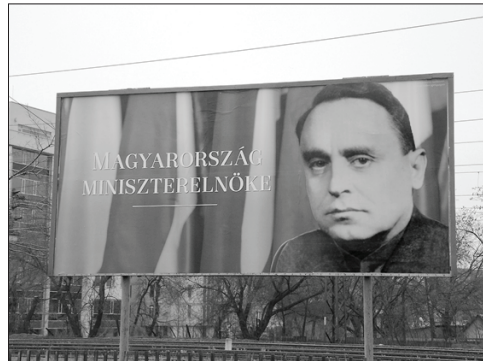
Figure 13.