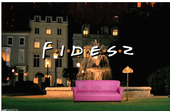
Figure 5. Source: http://www.nyugat.hu/tartalom/cikk/orbaneknal_mar_rozsaszin_az_let_egy_kanapeban , last accessed on 25 September 2018.