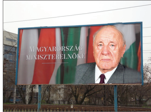
Figure 12.