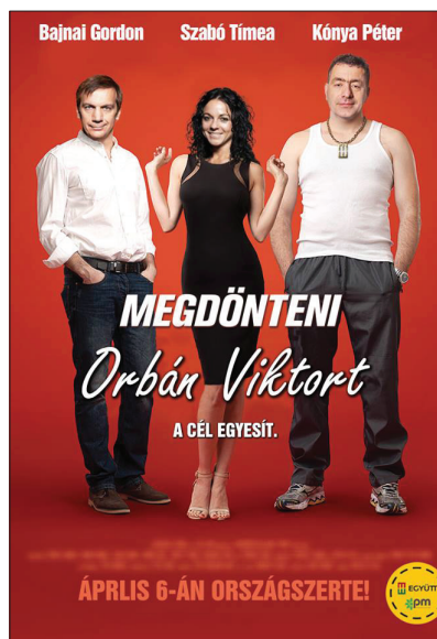
Figure 2.