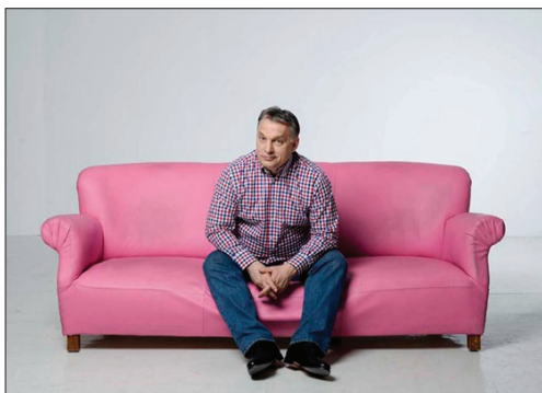
Figure 3.

Friends , with members of the governing party, Fidesz, taking on the main roles (Fig. 5). Another poster parody conveyed a direct political message in support of the left-wing party, MSZP, by placing politicians and other commonly known personalities linked to the Fidesz campaign, who had been involved in controversial issues or scandals during the campaign period, on the couch (Fig. 6).