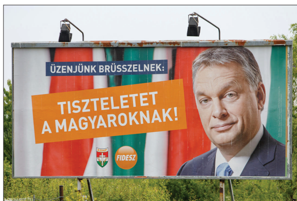
Figure 16.

Following their success in the parliamentary election, Fidesz repurposed the posters (shown in Fig. 7) for the European Parliament campaign by pasting a new text over the old one: “Let’s tell Brussels: Respect the Hungarians!”, and adding the logos of Fidesz and KDNP (Fig. 16).