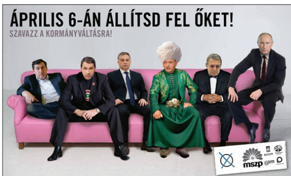
Figure 6. Source: http://hvg.hu/velemeny/20140402_Fotok_Rogan_basa_Cili_es_a_Baratok_kozt_ , last accessed on 25 September 2018.