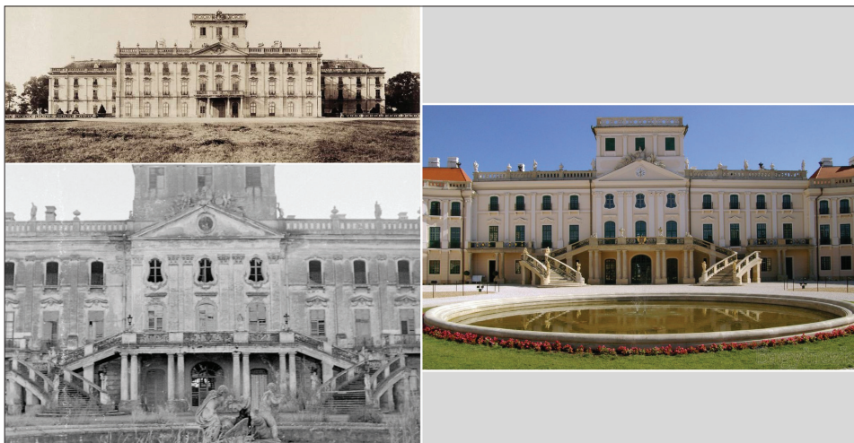
Figure 4. Monument protection on diverse levels: “little Versailles” in Fertőd.