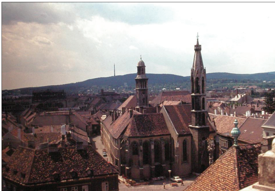
Figure 6. Sopron inner city in 1975.

Despite the outstanding cultural and historical character of the researched region, it was and mainly still is an agricultural area. The connecting tangible and intangible memories of, for instance, gardening, wine-making, and fishing are significant elements of the current perception of the valuable past. Museums and tourist farms promote traditional activities among the general public, while these activities are also scientifically investigated for their sustainability and environment-protecting potentials. 15 Besides fruit gardens and vineyards, the processing of reeds at Lake Fertő has been a continuous activity since the pre-World War II period. Moreover, it increased in quality and quantity during the Cold War period. Reeds as an architectural element were used not just for agricultural buildings, but for basic living constructions as well. Hungarian reeds were even sold in foreign markets, for instance, in the German Democratic Republic, and in the 1960s in the United States. By the end of the 1950s, the channel system that formed a circular shape on the lake was completed and maximised the harvest of reeds (Bognár 1966). Even though scientists have now determined that this has a major impact on the water level and is harmful to the environment (Dinka & Ágoston-Szabó 2005), these steps led to technical improvement, significant export power, and higher employment.