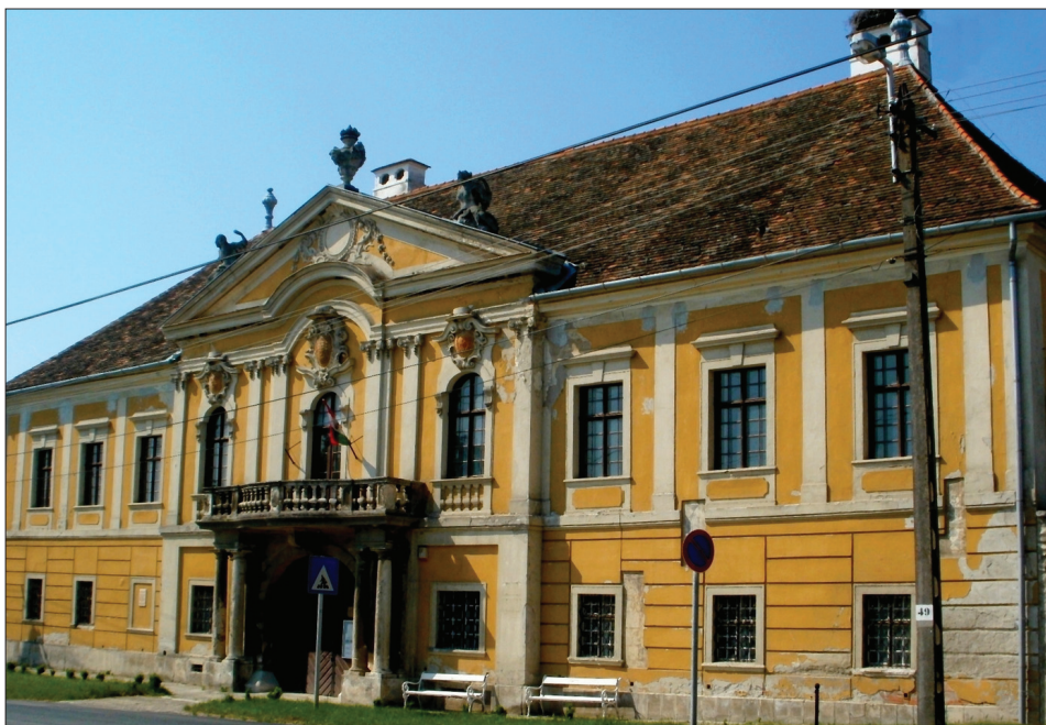
Figure 5. Bishop's Palace in Fertőrákos ( http://www.fertorakosikirandulas.hu/fertorakos/kastely.html ).