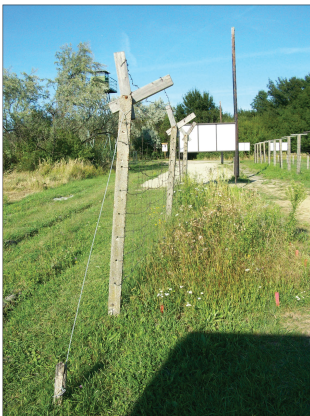
Figure 8. Hegykő Iron Curtain Memorial Site.