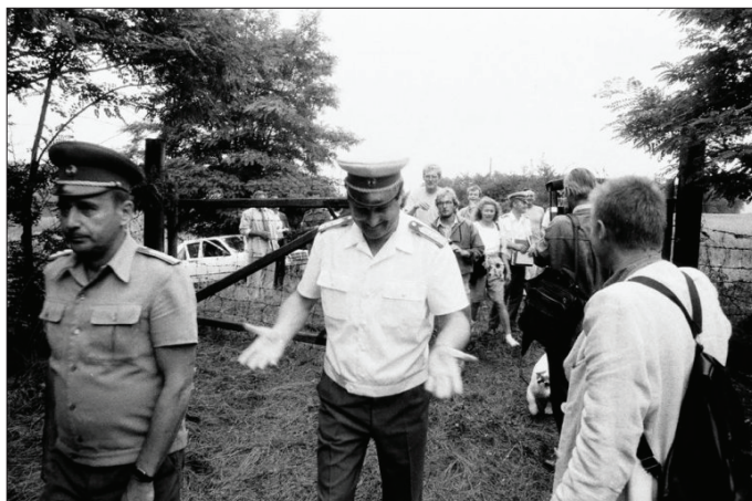
Figure 7. Pan-European Picnic 1989. Pan European Picnic Memorial Park website ( http://www.paneuropaipiknik.hu/index.php?site=50 ).