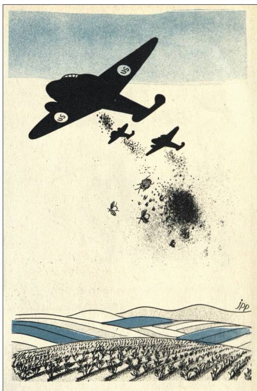
Figure 5. 'Western imperialists' intentionally dropping 'American bugs' (potato beetles) onto the fields of Central Europe, causing a plague. (Roháč, Vol. 3, No. 25, 1950, p. 11)