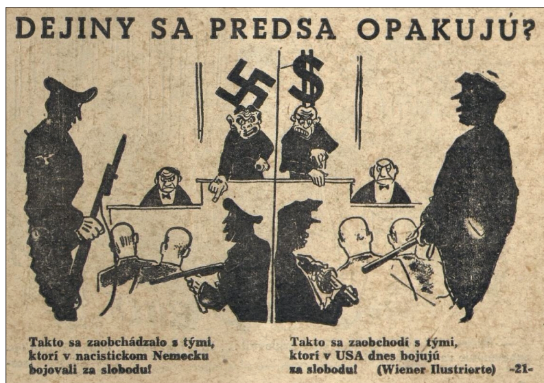
Figure 4. History still repeats itself. (Roháč, Vol. 3, No. 12, 1950, pp. 2–3)