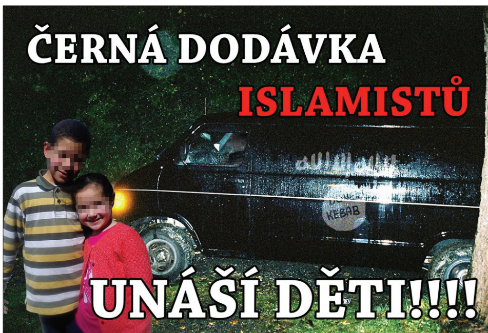
Figure 1. “Islamists’ black van is kidnapping children!!!” A hoax spread via Facebook in November 2015.