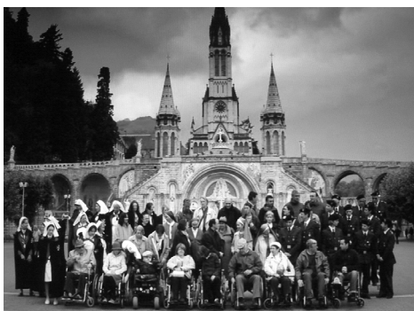
Figure 5. Group photo (still from Lourdes ).