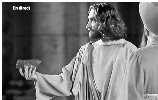
Figure 16. “Let he who is without sin cast the first stone” (still from Une femme nommée Marie).