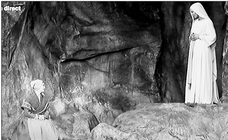
Figure 10. The Virgin Mary appearing to Bernadette Soubirous (still from Une femme nommée Marie).

The film Lourdes was filmed on location in Lourdes, with permission from the ecclesiastical authorities. The theatre spectacle Une femme nommée Marie was performed on the esplanade in front of the Rosary Basilica in Lourdes on 13 August 2011. A direct view of the stage was reserved for the sick and the VIPs invited by Robert Hossein. Others present in Lourdes could watch the performance on large screens. In total there were about twenty-five thousand viewers, including fifteen hundred sick persons. For the purpose of the performance, another large screen had been set up in the city centre of Paris, near the Notre Dame Cathedral. In addition, the national television channel France 3 presented a live broadcast of the show. 4