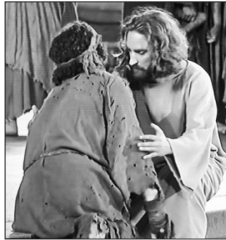
Figure 15. Jesus healing a leper (still from Une femme nommée Marie).

praise the true atmosphere of love, compassion and solidarity that characterizes Lourdes. I do, incidentally, venture to doubt the obviousness of this atmosphere of compassion in Lourdes, which seems to exist mainly in the eye of the beholder. In the days around the Assumption of Mary 2011, I witnessed the odd compassion and helpfulness, the usual ritual obedience and a great deal of miracle tourism. There is no such thing as an atmosphere of doubt or envy, for that matter. Lourdes is no place for doubt, let alone envy – if only because of the fact that the miracle-to-pilgrim ratio is far too disappointing to arouse anyone’s envy. Fact is that a testimonial piece like Une femme nommée Marie fits much better into the religious strategy of Lourdes as a place of