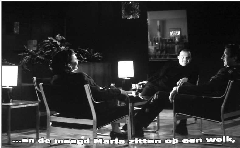
Figure 17. The Officer is telling a joke (still from Lourdes)

Hausner, on the other hand, prefers to refrain from all-explanatory expeditions in her productions. She expects her audience to give their own interpretation to the images and events. More than anything, she wants to emphasize the ambivalence of the miracle and the miraculous place in the film Lourdes ( Lourdes, a Film 2009: 15). Hausner sets out to find the prickly edges of the fairy tale: " Lourdes is a [cruel] fairy tale, a day-dream or a nightmare." She points at the unclarity as to when one should merit a miracle: "A miraculous