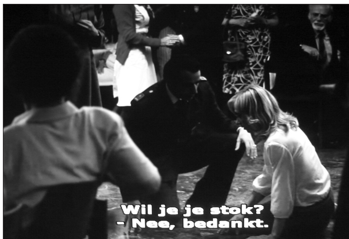
Figure 12. Christine falling down at the dance (still from Lourdes ).