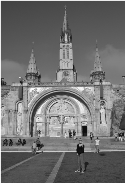
Figure 1. The Basilica of our Lady of the Rosary.