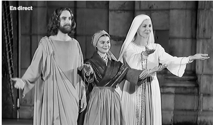
Figure 11. Jesus, Bernadette and Mary (still from Une femme nommée Marie).