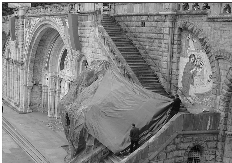
Figure 14. The cover of the stage grotto being removed for the performance of Une femme nommée Marie. Photo: Mereie de Jong 2011.

severely handicapped girl, is also beginning to respond to her mother's stimuli, which awaken her from her lethargy. Hossein's piece shows the true source of the miraculous power of healing: the humanity of God the Son and the omnipotence of God the Father. Jesus cured the lepers and even raised the leper Lazarus from the dead. Significantly, the show ends with the actors handing out bottles of Lourdes water to the sick in the front rows on the Esplanade. Hossein's piece opens the stage to a series of legends that are part of an age-long Catholic tradition and constitute the unshakeable truth of faith for the believers. Hausner's piece is in fact based on the same religious principle, with the difference that the director adds to it the introduction of the concept of doubt regarding the miracle. Is the healing really supernatural? If the cure is temporary, does that still make it a miracle? If God is behind it, why do the miracles seem so random? Why are some people cured, while others are not? Why does it not seem to matter how pious one is and how desperately one aspires to be healed? When God heals somebody miraculously, is it not cruel to see the miracle aborted after some time? If God is good and almighty, why does He not heal everybody? Or is He just good and not almighty, or, conversely, almighty, but not good? The severely handicapped daughter