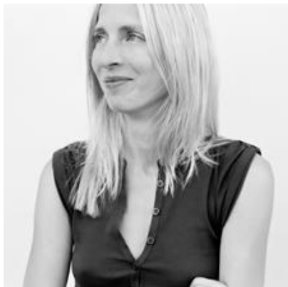
Figure 3. Jessica Hausner.