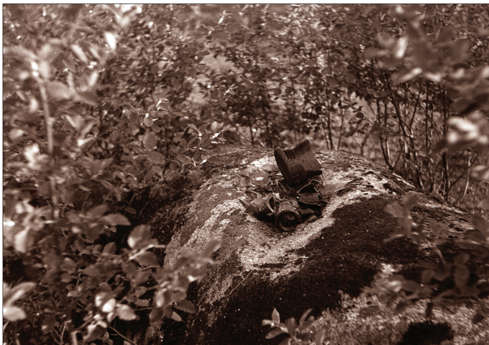
Figure 3. An offering stone with shards of glass bottles and pieces of horse shoes from Varbla from 1936.

As it can be drawn from these questions, there are examples in which the concept of destruction turns out to be quite problematic. Destruction might be a good and archaeologically recognisable criterion for distinguishing sacrifice and offering. Indeed, as seen in most of the definitions given above and from the several ethnographic and archaeological examples, killing, i.e., blood-letting and also consumption of the being, is a crucial element in performing sacrifice, which distinguishes it from offering (for northern Eurasian context see, e.g., Jordan 2003: 123–129; Vallikivi 2004: 94–95; Äikäs et al. 2009). I agree that destruction is very useful for emphasising inherent differentiations in the meanings and symbolism of ritual practices in the case of living beings. However, it remains a matter of debate whether this particular physical criterion should be a universal distinguishing criterion applied to artefacts and plants as well. Peter Metcalf (1997: 416) raises the problem: very often one talks about offerings in the case of different goods, but about sacrifice in those cases in which living beings are involved. He also points out that even the latter does not always necessarily include physical destruction.