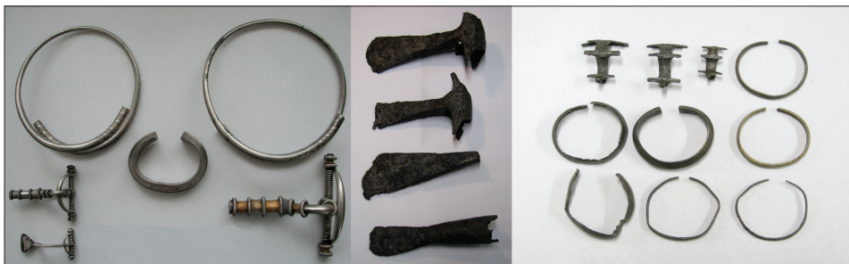
Figure 2. A selection of different Iron Age wealth deposits from Estonia: silver ornaments from Paali II (AI 3235), iron axes from Igavere (AI 2712: 45–49), and bronze ornaments from Reola (AI 4102) finds.

regarded as valuables. They were used for healing purposes and deposited in ritual activities. The concept of giving something away at a cost is thus very different from one context to another in the case of these stone axes. However, it would be farfetched to classify Mesolithic and Neolithic stone axe deposits under ‘sacrifice’ and later period finds under ‘offering’ due to the objects’ relative material value in their contemporary depositional context.