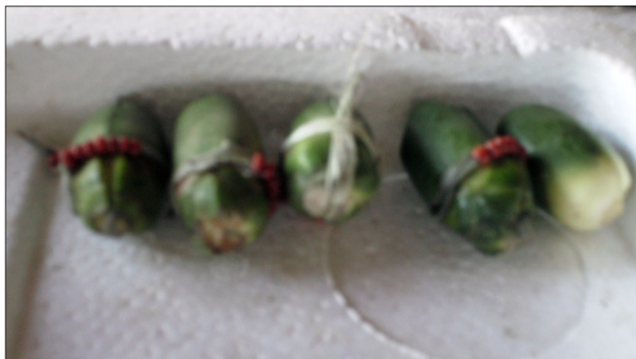
Figure 1. Each betel nut represents an evil spirit. From right to left as follows: natural death, unnatural death, bad thing, gossip, and jealousy.