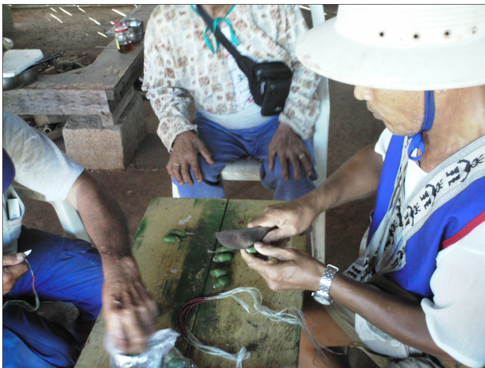
Figure 2. A wizard and his assistant are making a betel nut spell in the palakuan.