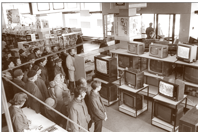
Photo 2. Television set department in Tartu supermarket in 1972. A black-and-white TV set cost an average person's three month's wage. Many people regularly watched sports broadcasts and news in shops. In the 1960s and 1970s, friends and neighbours gathered at a TV-owner's place to commonly watch films. Photo by Armin Alla. Courtesy of the photo collections of Estonian National Museum Fk. 1733:30.

from elsewhere, had studied in cities, etc. Some of them had tried to go directly to the United States and other Western countries, away from the war. The narratives reveal that the life of refugees was hard, though the hardships differ in individual stories. The Estonians preferred to settle in Sweden or Finland, which were geographically the nearest. Finland was also favoured because of language similarity, the shared experience in fighting together in the war of independence and the World War. All the informant groups, without exception, agreed in choosing Finland and Sweden as the closest migration destination. The same tendency can, in principle, be observed on refugees from today's crisis areas, who have chosen to resettle in a country close to their homeland. In these days, however, not all the Estonian emigrants could travel directly from Estonia to Finland or Sweden. Many arrived at their new country via Germany.