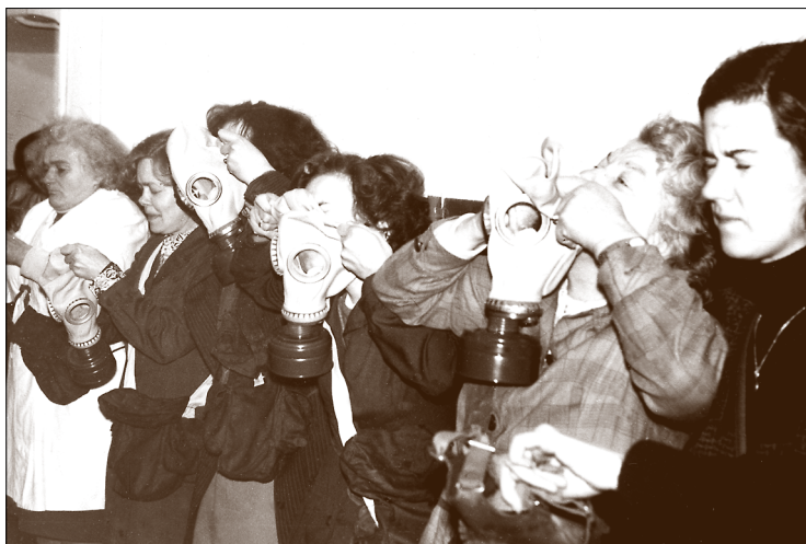
Photo 6. Groups of civil defence were formed in every institution. They published a leaflet and at least once monthly had a training session, teaching how to behave during gas or nuclear attacks, if the Americans were to attack the Soviet Union. A civil defence session in 1978, in Estonian Literary Museum: how many seconds to get a gas mask on? Courtesy of the photo collections of Estonian Cultural History Archive, B-37: 7325.

fact that carpets were deficit articles that could be bought only with special permits, obtained, for example, as a reward for good work, and even then the social and party status mattered. Thus a dead relative wrapped into a carpet was outwardly contraband and we can also see the motive for stealing. Without knowing the background reality it would be hard to understand why the story triggered so much reaction and why people believed it.