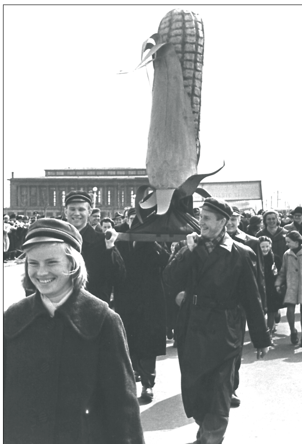
Photo 3. The May parade celebrating the global festival of workers was a compulsory participation event. The procession was decorated with topical posters, sometimes there were also gymnasts or acted scenes on lorries. In the 1960s, centrally reinforced growing of corn and making of silo were endless sources of folklore. Photo shows students of the Estonian Agricultural University at the 1960 May parade.