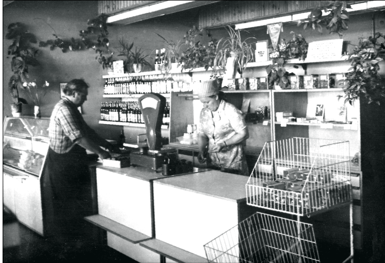
Photo 5. Soviet stores had a meager choice of foods, while liquer shelves were – up until Gorbachev’s dry rule – bulging with alcohol. Remsi rural store in 1980. Photo by Rein Olli. Courtesy of the photo collections of Estonian National Museum, Fk. 1909:24.

to law it is forbidden to sell vodka after six o’clock. “There’s a regulation.”