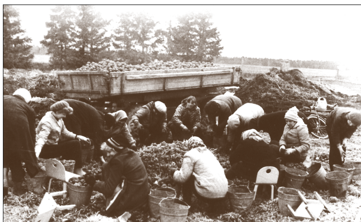
Photo 4. All through the year, city people were sent to the country to help collective farms: kolkhoses and sovkhoses. In the spring, they helped plant, in summer to make hay, weed, ridge potatoes, in autumn harvest linen and potatoes. Harvesting potatoes often involved being sent to the other end of the republic for a week or even a month. Only mothers of small children and the ill were excused. In addition, there were forest planting and other useful campaigns, for example in April around Lenin's birthday, a Saturday was spent cleaning the city or work rooms. On the picture, people sorting potatoes on a communist Saturday at Riisipere sovkhos in Harjumaa, April 21, 1984.

tions, but to still comply to the tacit behavioural norm of the community.