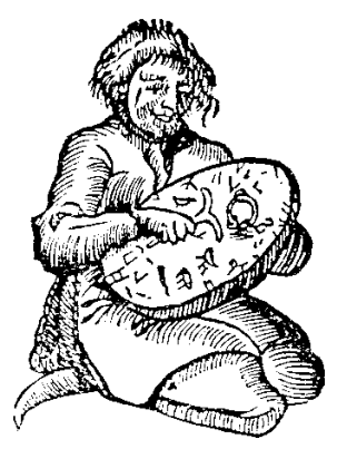
Figure 3. A Sami witch saying charms. After J. Schefferus (1674).

The Meandash-maiden as a young woman and the mother of Meandash, appears in this version only. Other tales speak of an old wise and experienced woman (which in ancient Finno-Ugric tradition suggests a witch). According to the narrator, Meandash-nijt lives in human form, and only becomes a reindeer-cow upon the crossing the river of blood. She has settled in Meandash land with her children. who include the eldest son, whom she has said: "You are meandash – the reindeer." as well as her nameless vounger children (reindeer calves). No father is mentioned however. The son did not feed on grass and lichen, as a reindeer would, but instead went hunting, i.e. followed the traditional life style of the ancient Sami.