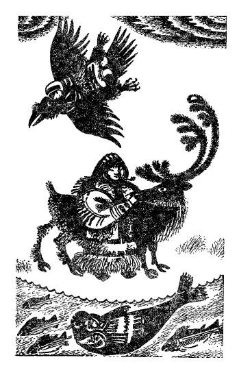
Figure 7. Three suitors. An illustration by V. Petrov, after Sangi 1985. The artist has had a vision of a three-sphere universe.

The eighth story is already familiar in its contents (see also the seventeenth story). V. Charnoluski has recorded two stories with the same title: one from Aahkkel and the other from Turia (cf. the 13th story). The Aahkkel version is very characteristic to the Meandash's marriage of the second subgroup, although the proposal motif is rather brief.