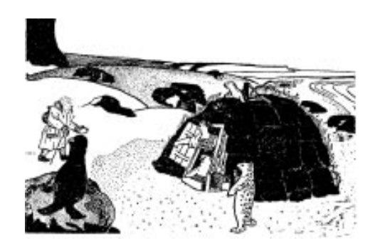
Figure 6. The seal son-in-law. A drawing by V. Charnoluski.

deer. The only similarity between the second and the first subgroup of stories is that it is the youngest daughter of the old man (or the mortal Sami man) and his wife who is married to a reindeer.